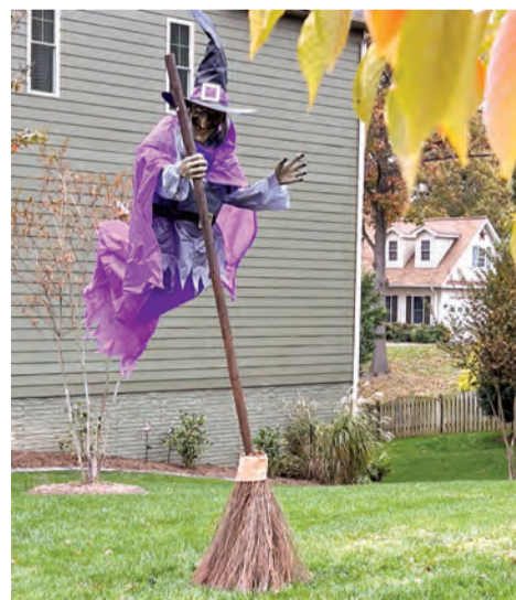
Witches were seen taking to area skies in increased numbers in the lead up to All Hallows eve.