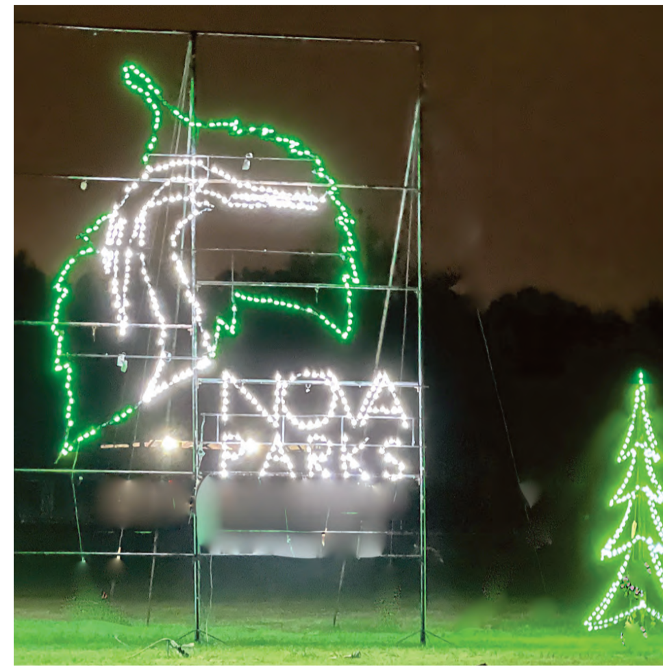
NOVA Parks huge “Festival of Lights” welcomes seasonal celebrants with hundreds of displays.

vorite symbols, characters, or representations of outdoor activities. Bull Run’s festival hosted over 62,000 vehicles in 2022. With timed entry tickets sold by vehicle, it’s estimated that about a quarter of a million people saw last year’s show. It’s become a traditional hol-