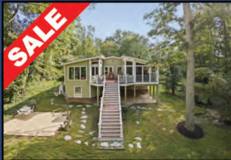
4108 Sulgrave Dr $949,000

"Don't take a chance that could cost you thousands. Always contact the area's proven leaders!"