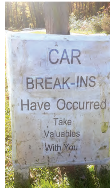
A sign in the South Kings Highway lot for Huntley Meadows.