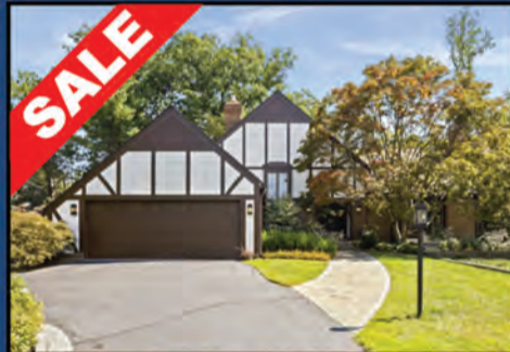
3606 South Pl $1,050,000