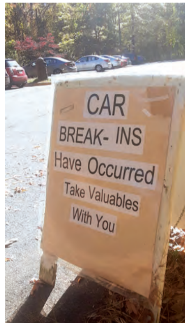
A sign in the Lockheed Boulevard lot for Huntley Meadows.