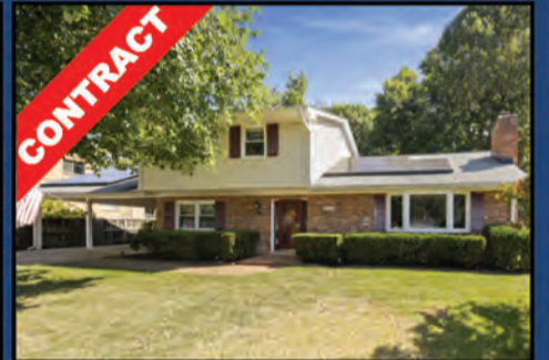
8527 Springman St $675,000