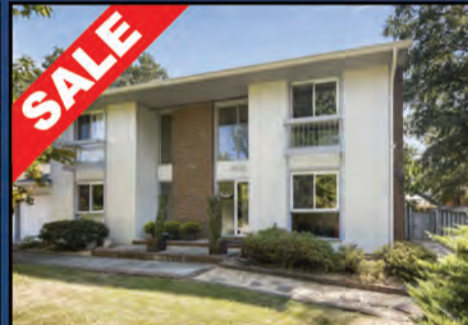
9421 Old Mt Vernon Rd $899,000