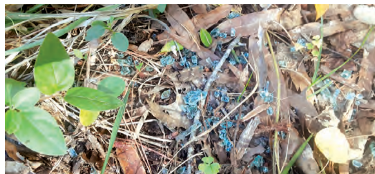
Shattered car window glass could be seen in the Lockheed Boulevard lot for Huntley Meadows.