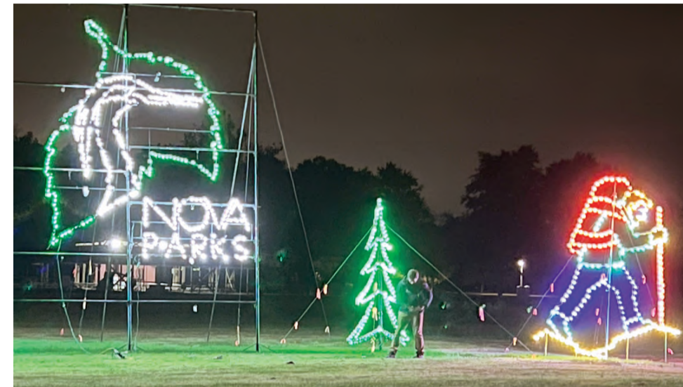
Night work reveals any missing bulbs or unplugged cords before show opening.

At the culmination of this colossal preparation effort, from the ease and comfort of