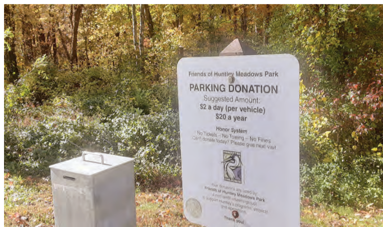
Park goes questioned the parking donation request in the South Kings Highway lot for Huntley Meadows.

Another park visitor had her car broken into twice, and in the end it cost her about $1000. "My car lock was punched in and door handle was broken at Huntley Meadows on Oct. 7," she said in an email. "After I got it repaired, I went back to Huntley Meadows twice and shortly after the second