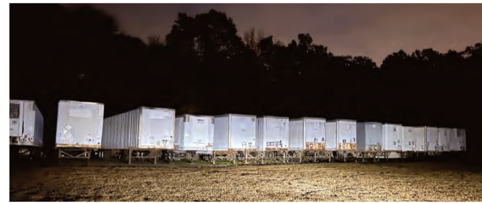
A fleet of van trailers is needed to store all the materials that make up the seasonal display.

your car, you and your family can enjoy the festival’s sparkling, colorful lights, which add to the uplifting spirit of the holidays. Drive along the two and a half mile stretch of holiday light displays, and expect to hear ooh’s and aah’s continue as passengers recognize fa-