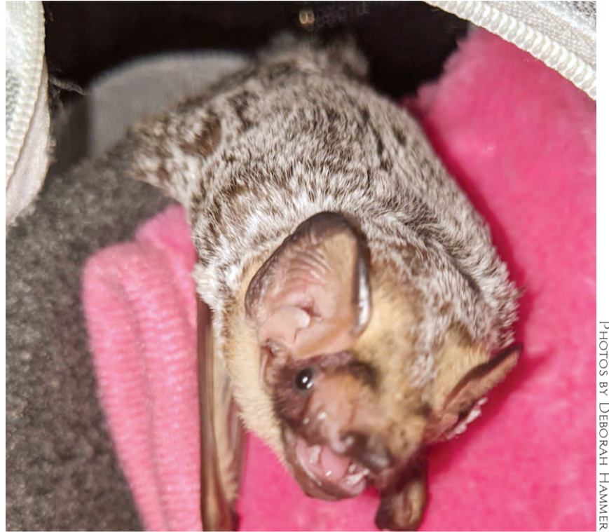
Hoary bat smiling for the camera.