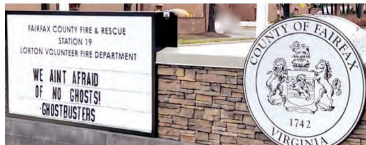
We learned our brave fire fighters are not even afraid of ghosts.