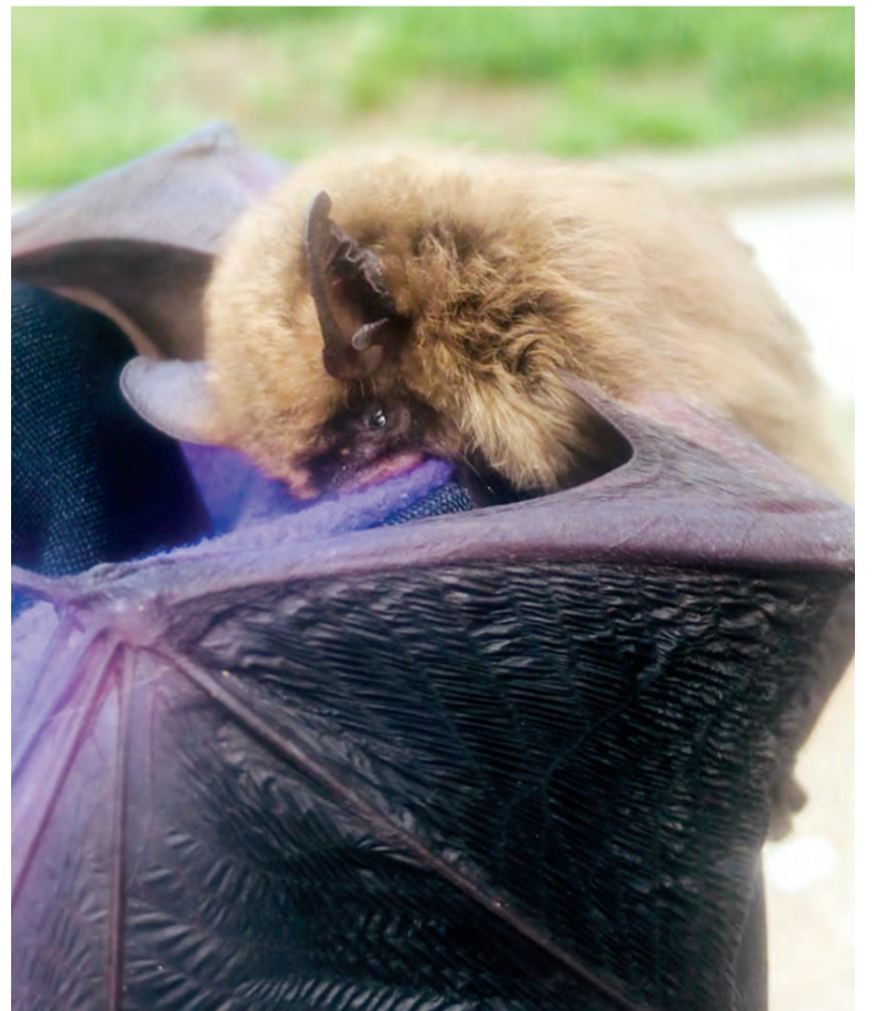
Big brown bat being shy.

Other threats include outdoor cats, night lighting, pesticides, herbicides, noise and collisions with power lines, vehicles and wind turbines.