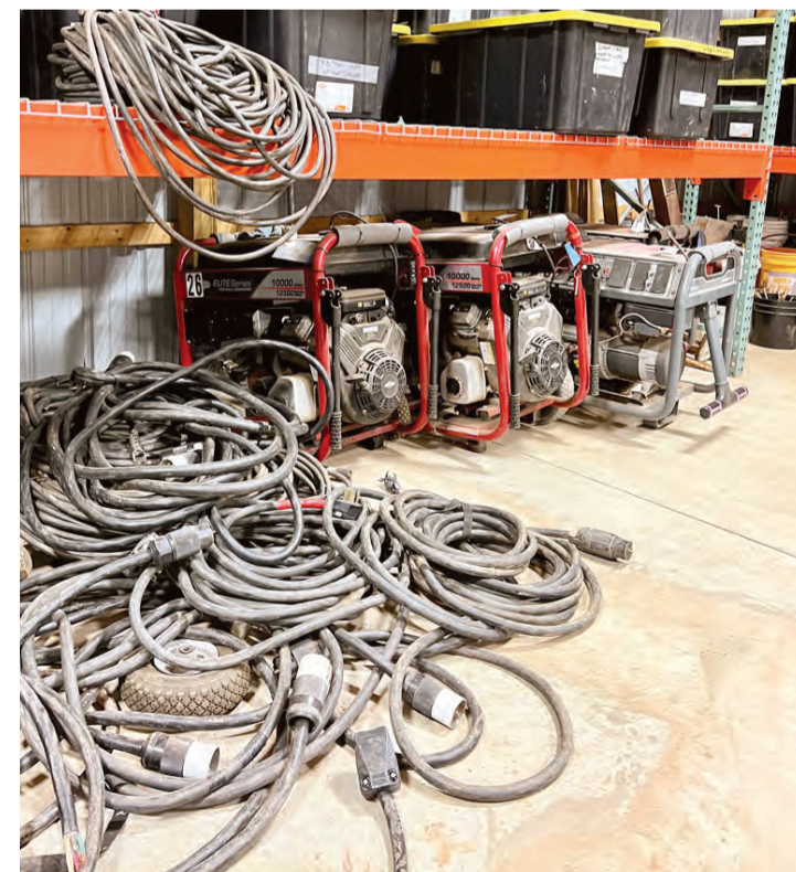
Shelves full of display materials, power cords, and generators await service along the event route.