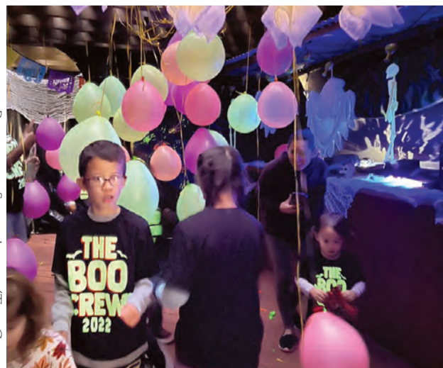
What's Halloween without a haunted house? This one cleverly make with balloons, eerie lights, and popcorn plastic flooring creating creepy foot sounds for every walker brave enough to enter.

Normally quiet neighborhoods heard sounds of screams, squeals, and shrieks ... of delight, as locals celebrated the favorite holiday of many, children and adults alike. After what was a two year hiatus from normal trick or treating, even rain could not dampen the enthusiasm of ghouls, witches, and, of course, of super heroes.